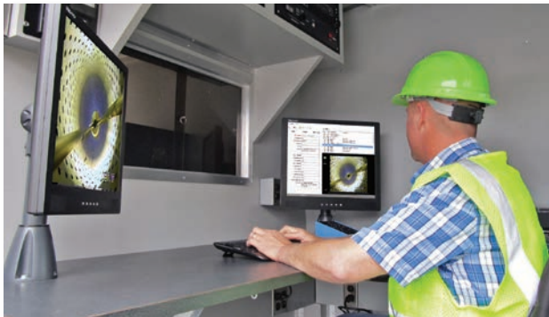
BoreOptix works with Aries' mobile and vehicle-mounted inspection systems.

BoreOptix integrates seamlessly with Aries systems. It includes one-year free technical support.